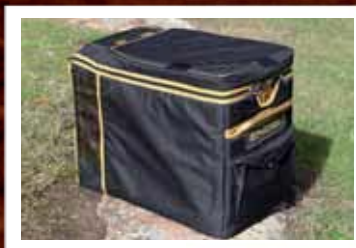
Limited edition transit bag