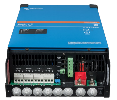
Connection Area Quattro-II 48/5k